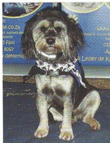
Gumby as a service dog with his Certificate of Achievement