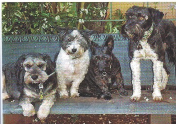
Gumby, Cyclops, Jumpies & Dini – the wonderful "Pana Pack"

Gumby loves to be petted and is clearly comfortable in his own skin. He will allow autistic children to braid his ears or will just lean quietly against an elderly or ill person. He seems to personify empathy and is able to just "BE" in the moment - whether it is dealing with out-of-control hyperactivity, a commotion in a ward, or just offering a little love to an elderly person in need of dog healing. 🐾